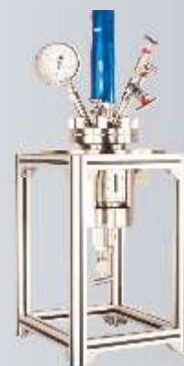
Sight glass along the vessel length