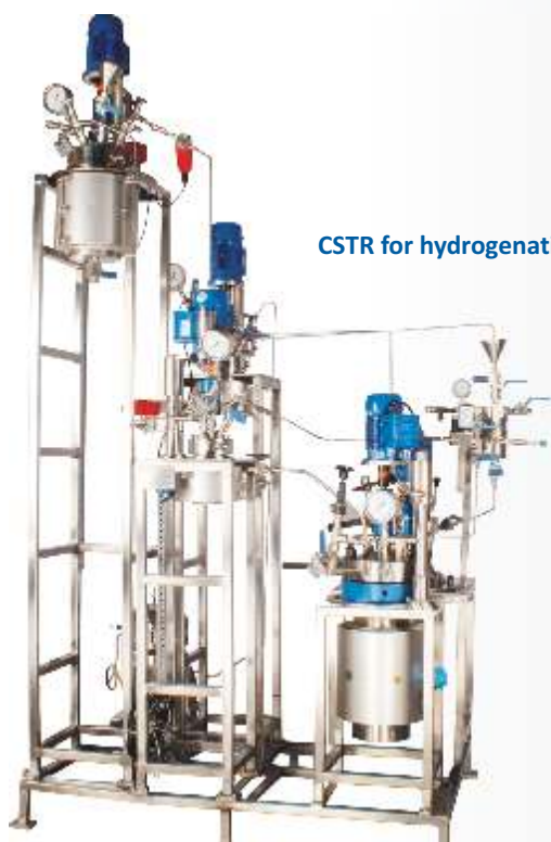
CSTR for hydrogenation