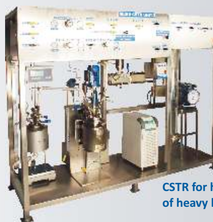
CSTR for hydro-cracking of heavy hydrocarbon oils