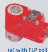
(a) with FLP coil

This is standard for 50 ml - 250 ml autoclaves, however for bigger autoclaves if the cold water line pressure is less than 2 bar then it is better to opt for external pump & tank water cooling system. Normal tap water cooling is not effective at higher temperatures due to steam back pressure whereas pump & tank auto cooling system gives positive pressures & faster cooling.